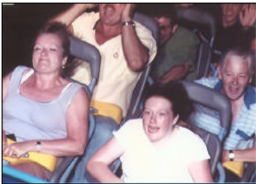
Stiff upper lips, and all that — hard to do even for an Englishman, or woman, at Cedar Point!

No problems here. Nervousness is mounting again; I think that it might be better to return to the Millennium Force at Cedar Point. Anyway we pluck up courage and ask, "Is your name Denbow? Yes? Great, so is ours, we're from England".