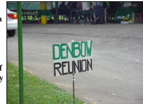
This sign beckoned our English cousins as it did all visitors to the Denbow Reunion in Ashland.

back in Boston we have clocked up 2980 miles in the car. Just timed it right for another shopping trip – we needed another large case for our 'souvenirs'. Not bad for a trip to see the neighbours across the pond. The flight home was uneventful, and we have time to reflect on the past few weeks. Many wonderful sights, but what remains most in our memories is the Denbow Family Reunion. I hope we will be able to pop over again one day.