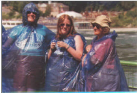
English Denbows prepare to adventure into the mist Niagara Falls.

Its Friday evening, and we have made it.