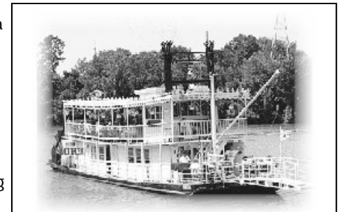
The Lorena Sternwheeler is the riverboat on which our dinner cruise will take place. She is moored at Zane's Landing Park at the west end of Market Street and is 104 feet long, 17 feet wide. The hull is 68.5 feet and draws 2.5 feet of water. She has carried governors, Miss Americas, Anita Bryant, Pat Boone, and the Imperials.

For those you who are going on the dinner cruise on Friday, the boat will leave about 7:00 p.m. for a two hour trip. If you can plan to get to the dock area at about 6:00, we will have a little informal get-together — renewing old friendships and discovering new ones. There are several families signed up for this cruise who have never been to a reunion before — this includes families from Southeastern Ohio and Sistersville, W.Va.